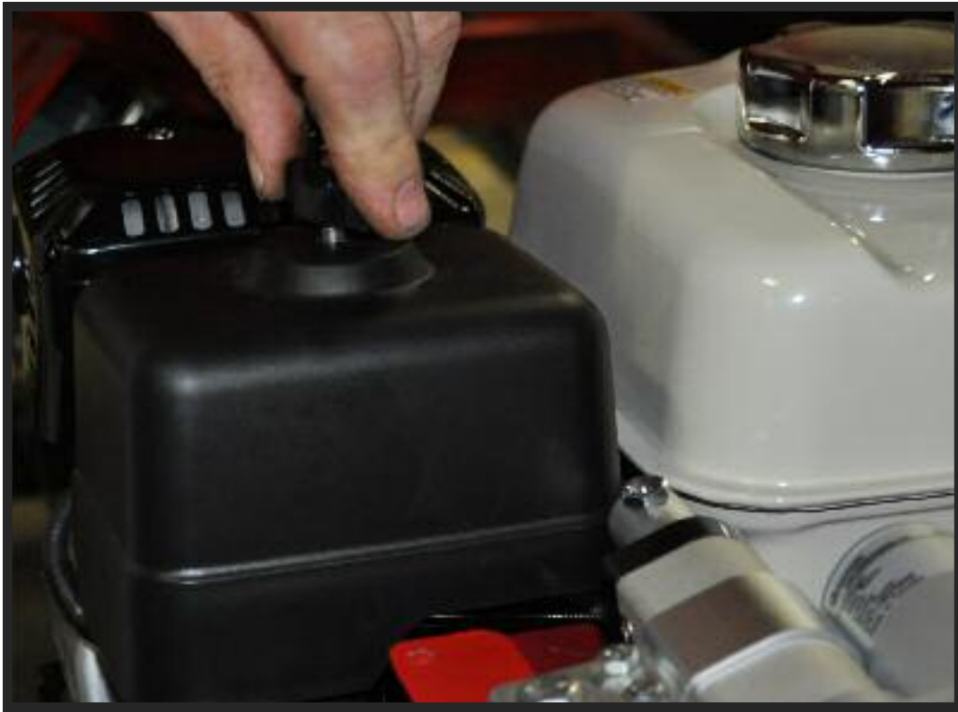
Re-install air filter cover.