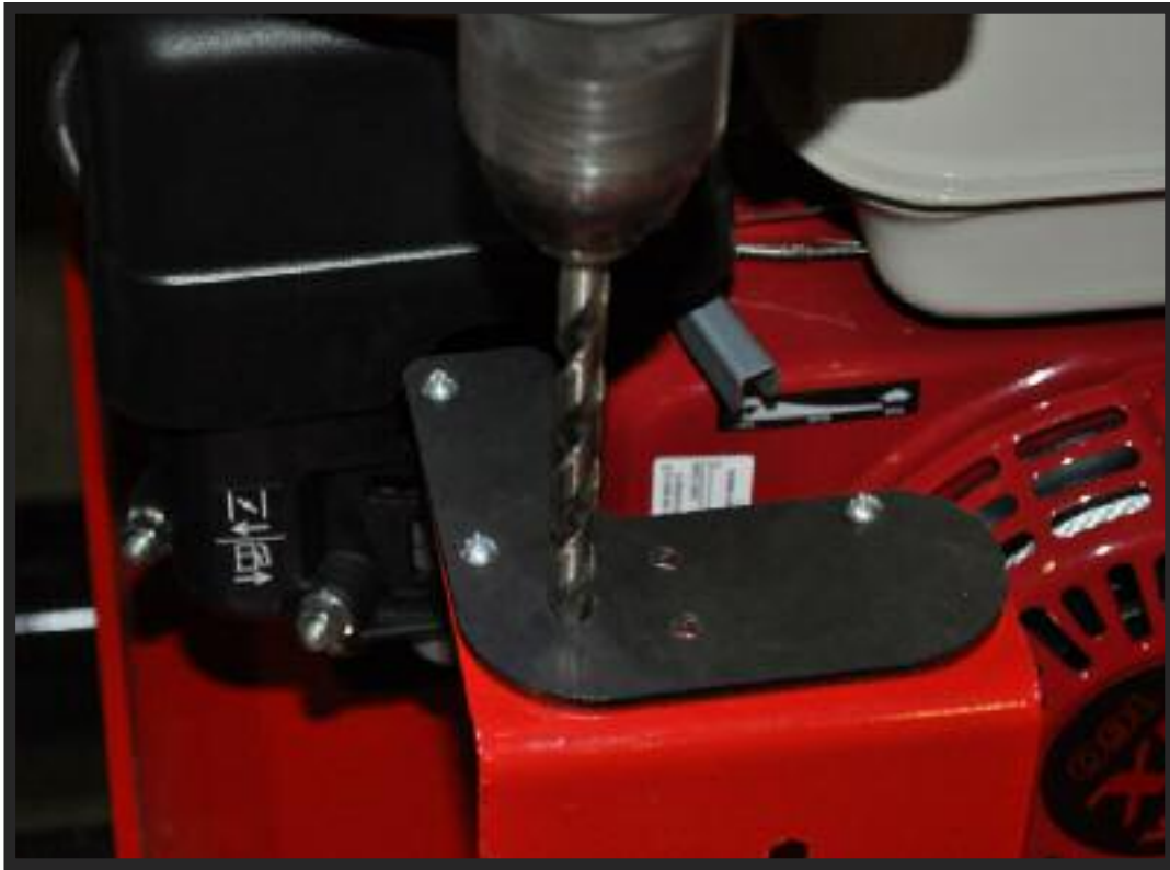
Use guide holes to drill three new mount holes.