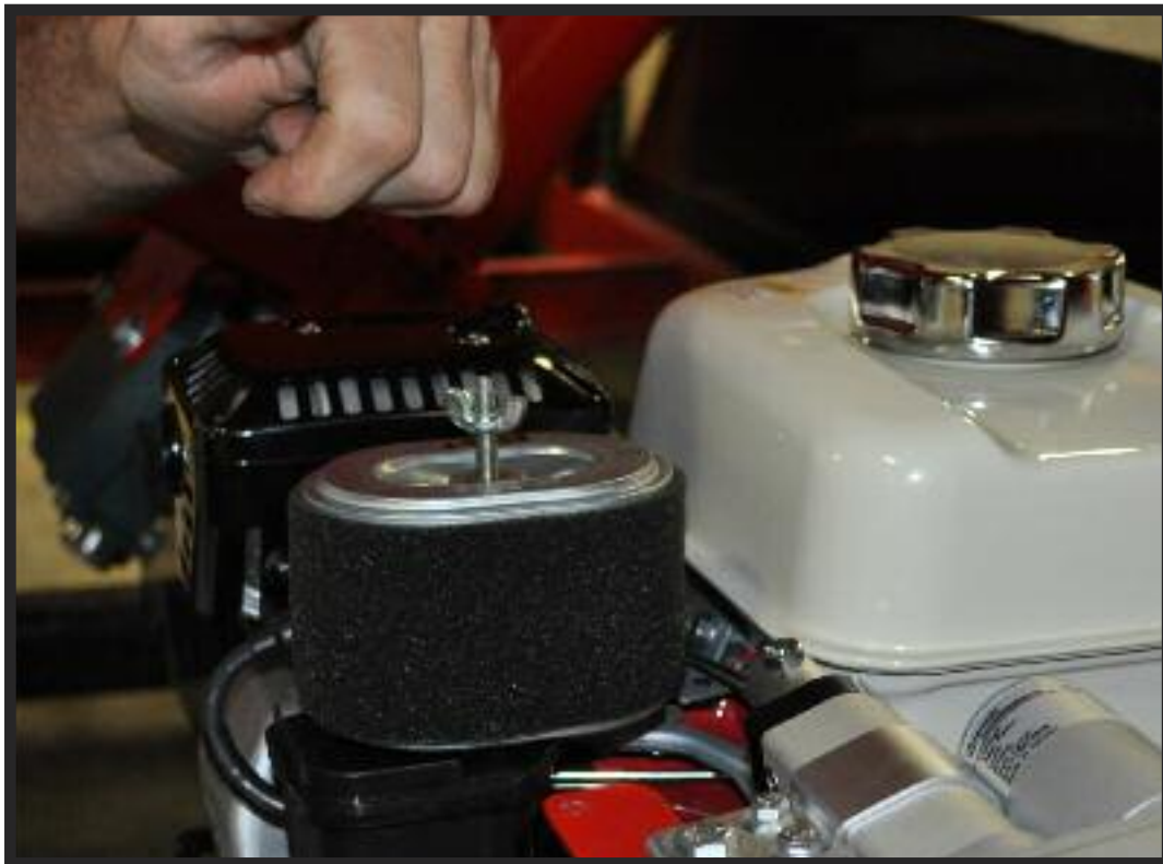
Re-install air filter.