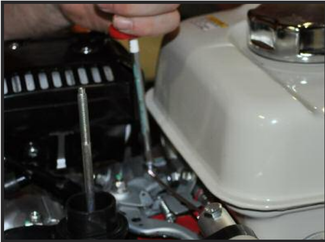
Tighten set screw on throttle plate once final position is determined.