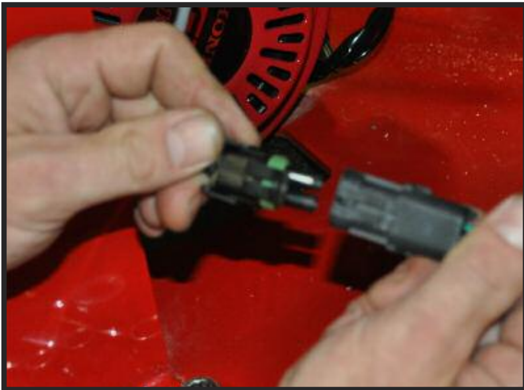
Attach wire connector to existing harness. This is necessary at this stage in order to determine placement of actuator in both full-throttle mode and idle-mode range.