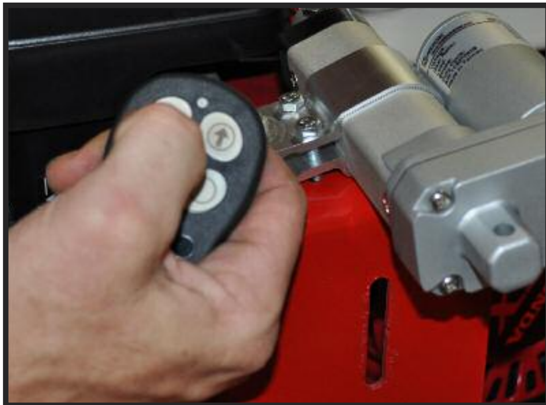
Test to ensure unit for satisfactory function.