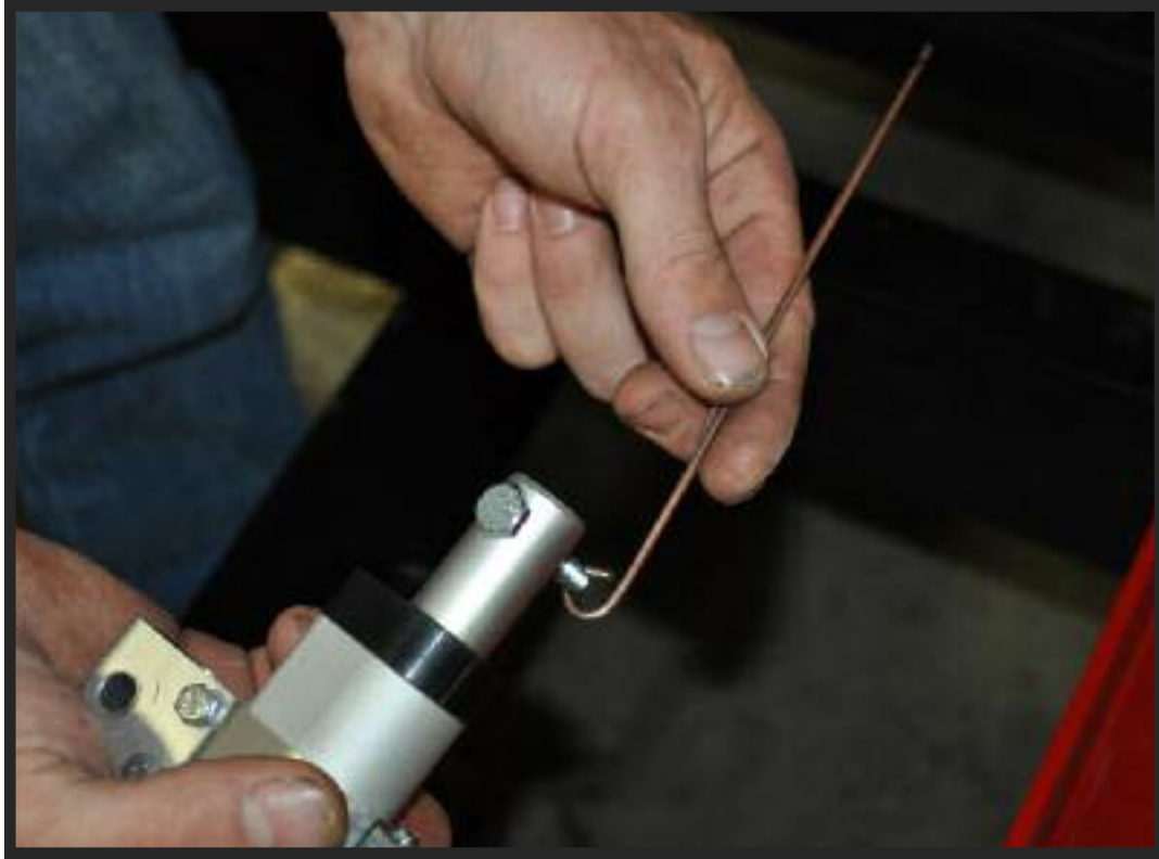
Connect linkage rod to throttle actuator.