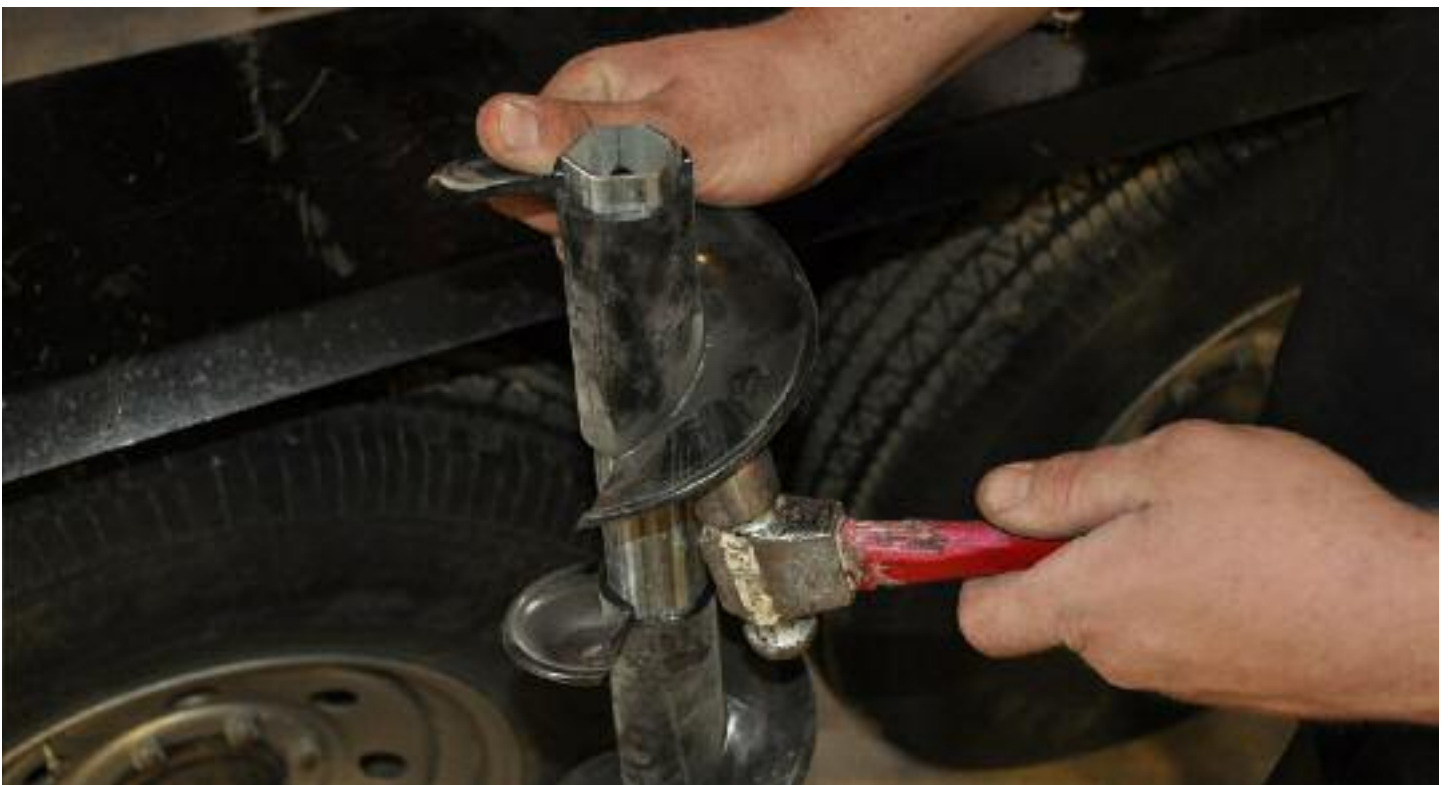
Remove broken flighting.