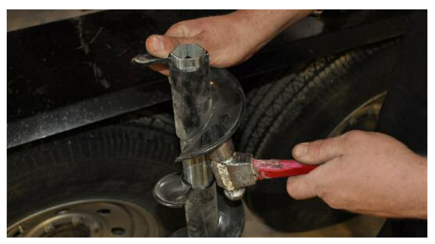
Remove broken flighting.