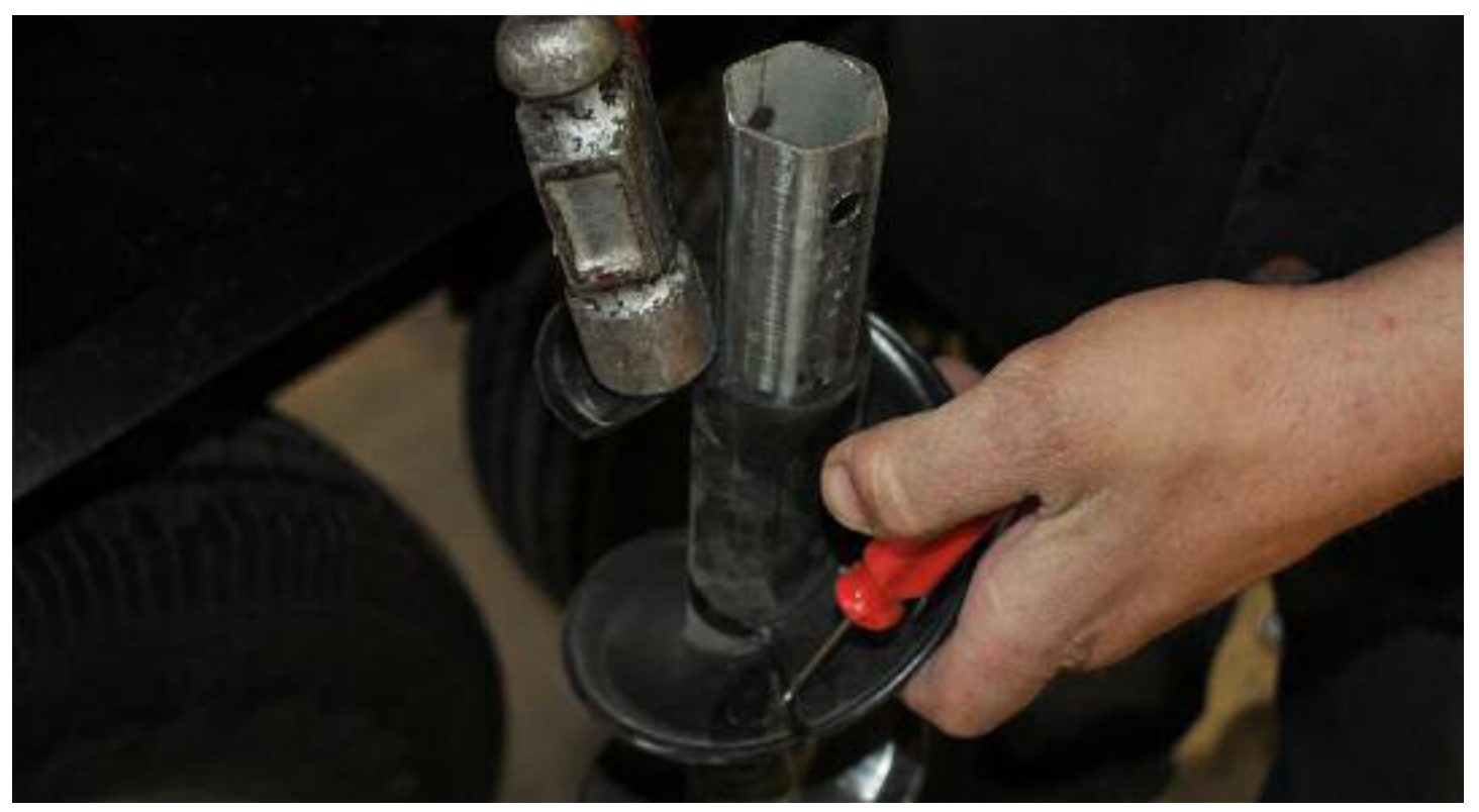
Use a screw driver and pry back the flighting enough to allow you to tamp down the flighting. Then you can replace the Drive Dog and all bolts.