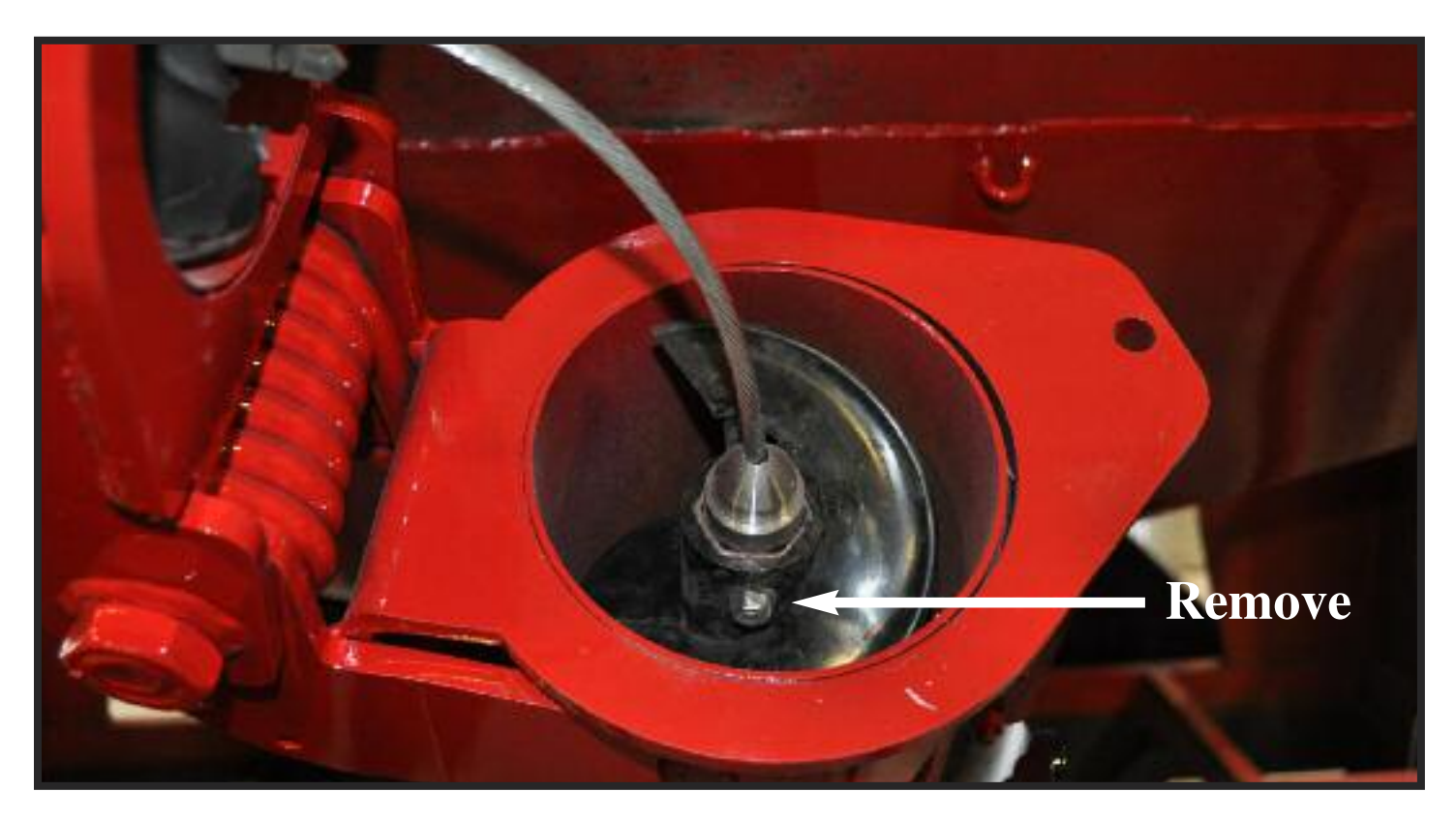
Remove top bolt on bottom auger.